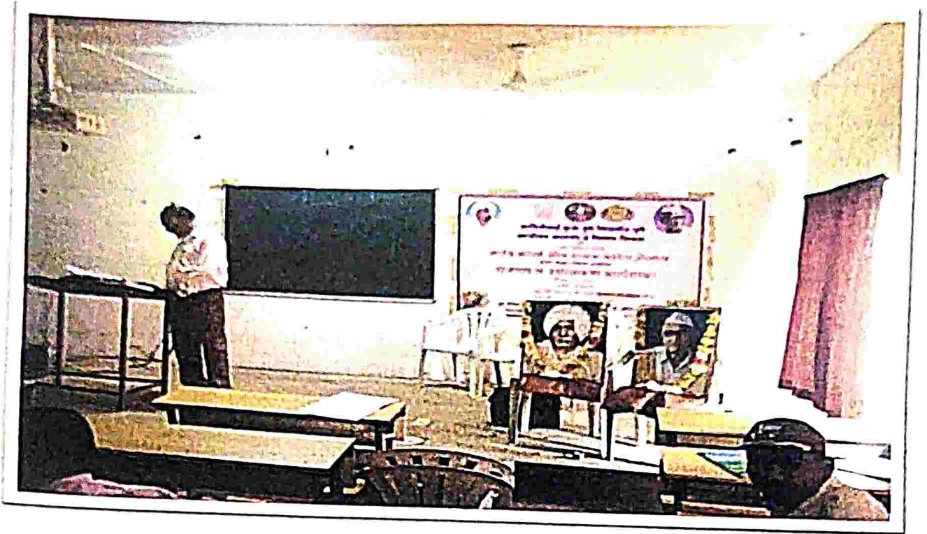
Employment and Entrepreneurship Workshop Photo