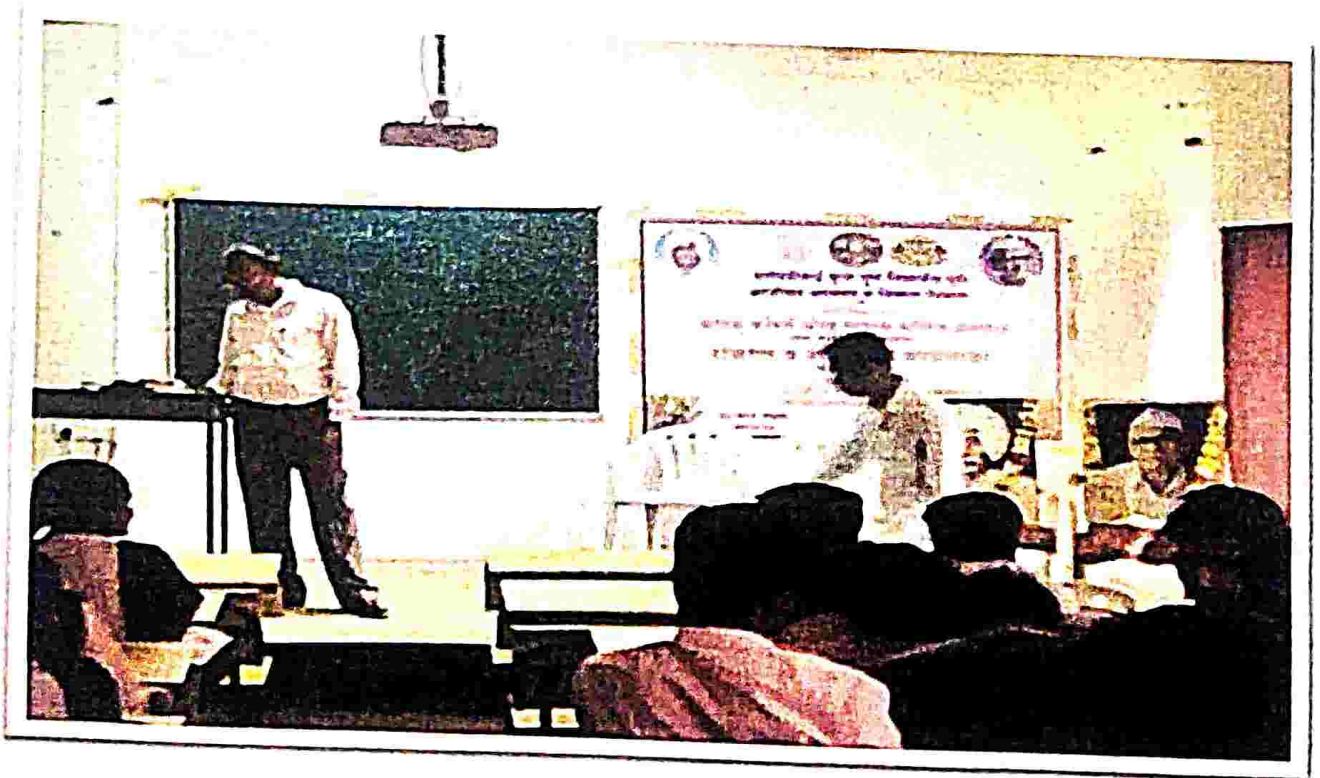
Employment and Entrepreneurship Workshop Photo